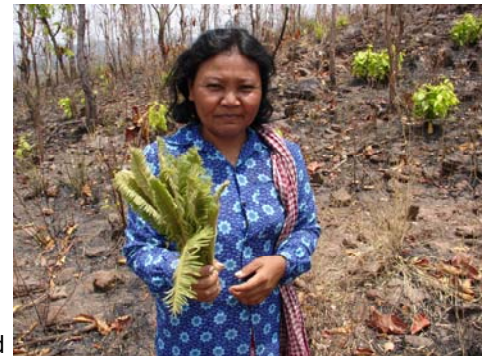
Villager collecting NTFPs