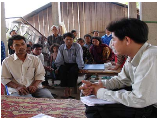
Ponreay (CFI) provides technical assistance.

There are approximately 150 families in Phum Dong, with over 300 adults applying as CF members (virtually all). Both women and men play an active role in management and daily patrol activities.